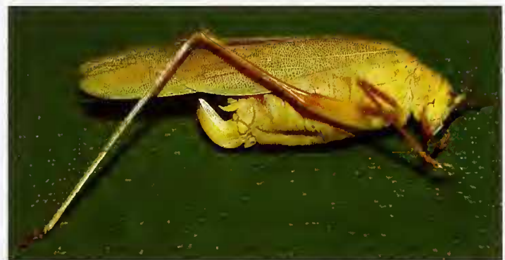
Fig. 1. The voucher specimen of Phaneroptera falcata from E of Wigierski National Park, Northeast Poland.

On August 13, 2010 two of us (WB & PW) passed through northeastern Poland towards Lithuania. On road no. 16 east of Wigierski National Park, between Serski Las village and Sejny, at 53.55N and 23.09E, when searching for lizards on a spruce forest clearing, we happened to find an adult female of P. falcata (Fig. 1) which in view of what is said above seems to be a remarkable record, as it ex-